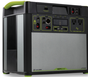
Portable Backup Battery

Get a free , clean-energy backup battery to operate your medical device during an outage.