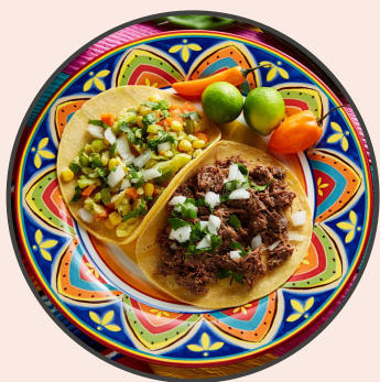
Food & Drinks From South of the Border