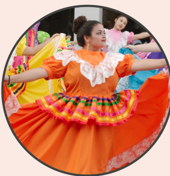
Live Music & Dance