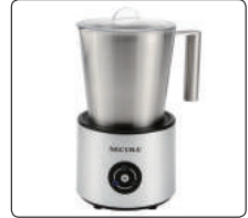
Secura Automatic Milk Frother