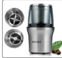
Secura Electric Coffee and Spice Grinder