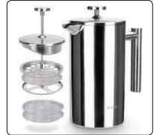
Secura French Press Coffee Maker