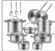
Duxtop Whole-Clad Tri-Ply Premium Cookware