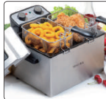
Secura Triple Basket Electric Deep Fryer