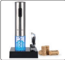
Secura Electric Wine Opener