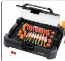
Secura 1700W Electric 2-in-1 Grill Griddle