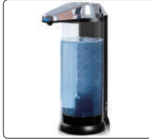
Secura Electric Soap Dispenser