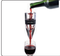
Secura Premium Wine Aerator