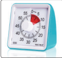
Secura 60-Minute Visual Timer