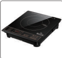
Duxtop Portable 1800W Induction Cooktop